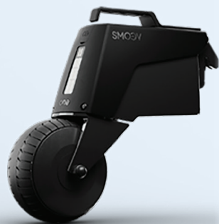
SMOOV 6mph Version